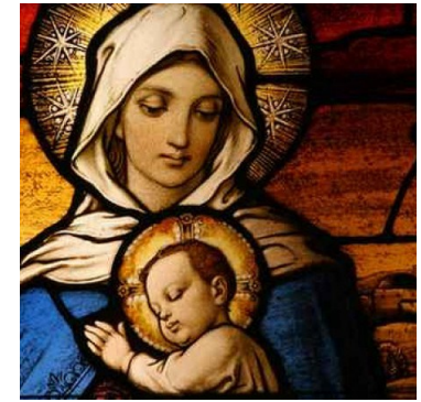
St. Mary, Mother of Our Lord